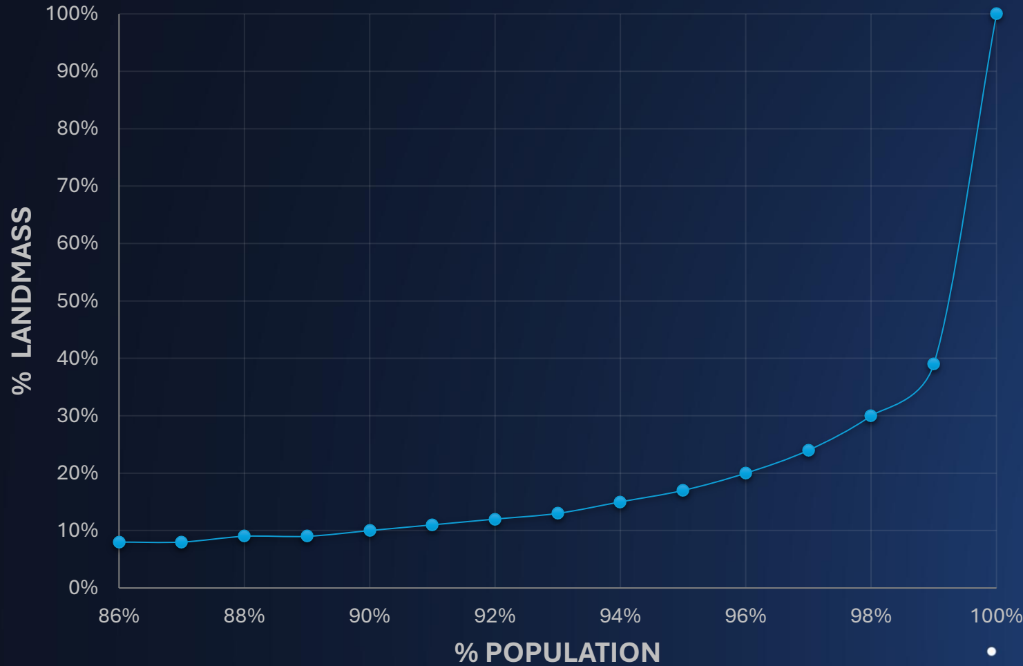
World population distribution as percentage of landmass (source UNdata)

• Terrestrial solutions currently cover 96% of the population using infrastructure deployed across 20% of the landmass.