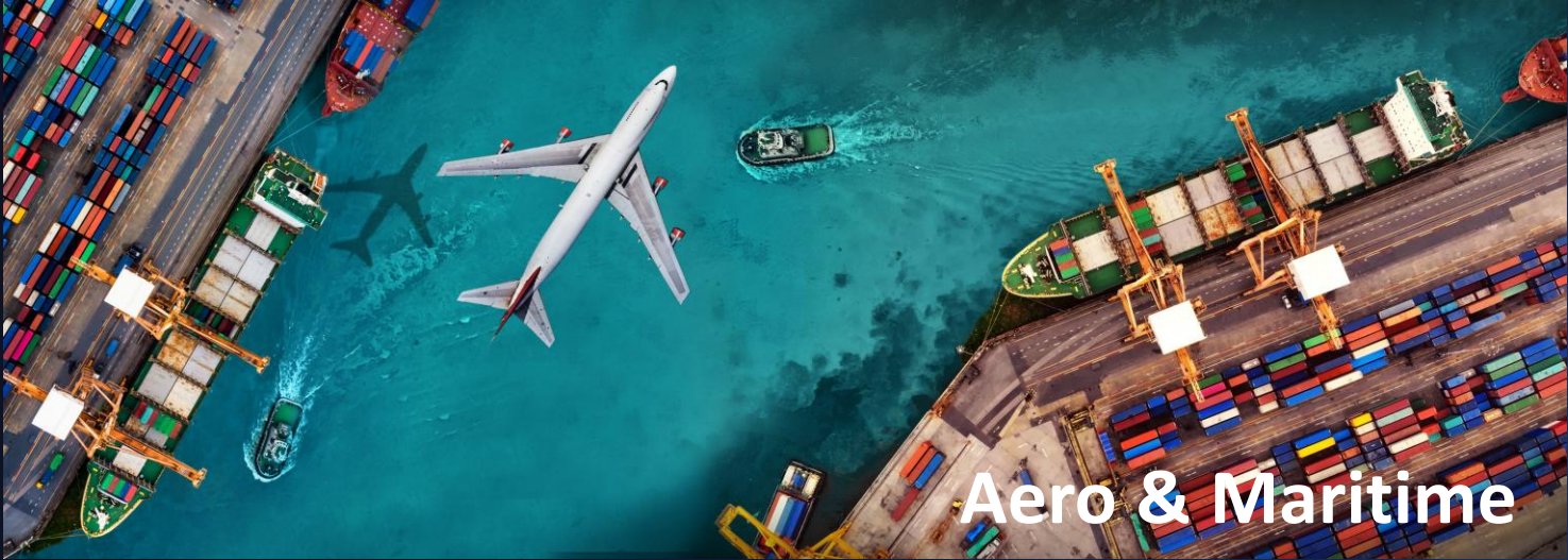
Aero & Maritime